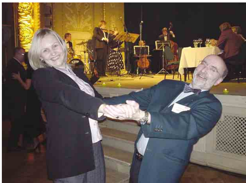
Fig 2. Come dancing