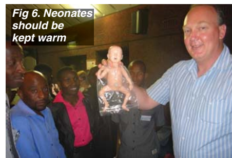
Fig 6. Neonates should be kept warm