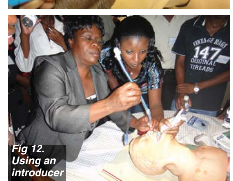
Fig 12. Using an introducer

and approaches to the anterior neck (fig 14) in a failed intubation failed ventilation scenario. Also on the second afternoon were further workshops on blocks (fig 15).