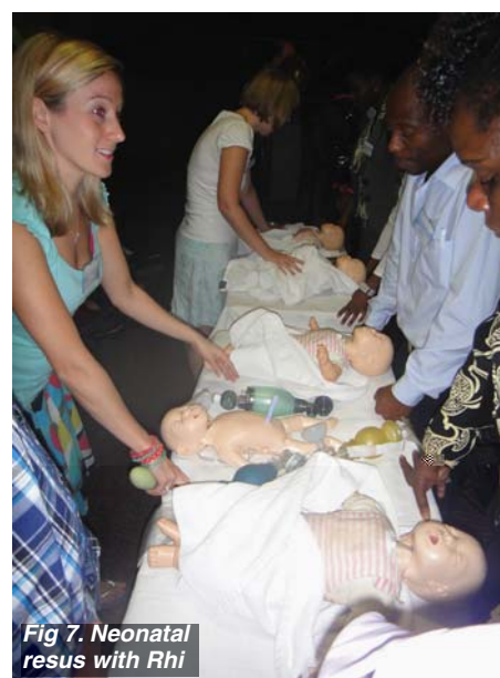
Fig 7. Neonatal resus with Rhi

Afternoon workshops were on neonatal (fig 6, 7), paediatric (fig 8) plus maternal resuscitation (fig 9) and airway management skill stations