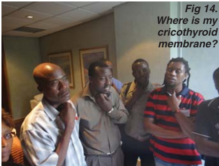
Fig 14. Where is my cricothyroid membrane?