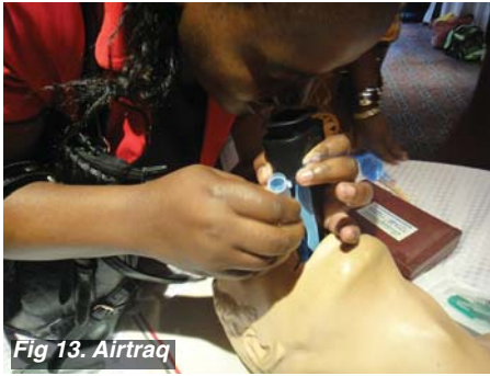
Fig 13. Airtraq