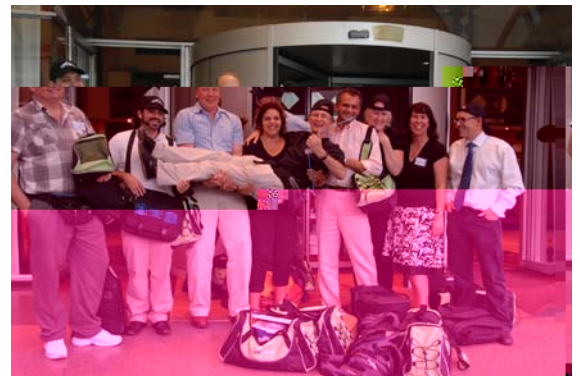
Some of the team outside the Crown Plaza Hotel