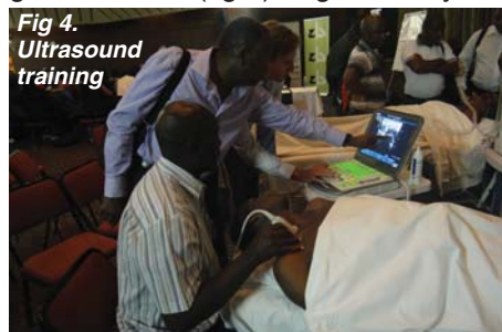
Fig 4. Ultrasound training

South African based representatives of Mindray and B Braun . With up to 40 delegates in each workshop these tended to be rather more discussion than hands on although the number of dummies provided by the local