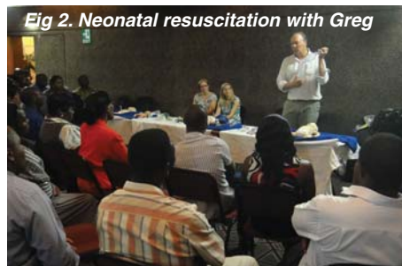
Fig 2. Neonatal resuscitation with Greg

The afternoon consisted of workshops covering neonatal resuscitation (fig 2), management of obstetric