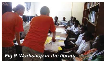
Fig 9. Workshop in the library

The final item of the day was the quiz with questions based on topics covered in the workshops projected on a wall. All delegates were asked to stand up – if they thought the answer was true they put their hands on their head, if false by their sides.