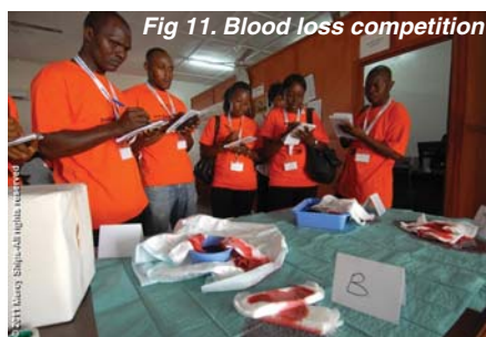
Fig 11. Blood loss competition

The anaesthetic programme consisted of workshops on neonatal resuscitation, epidurals and eclampsia/critical incidents. Day 2 for the anaesthetists ended with a Q & A session and another prize quiz.