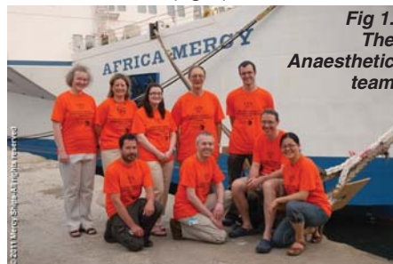
Fig 1. The Anaesthetic team