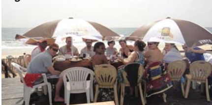
Fig 19. Restaurant on the beach

We passed the city's main landmarks including 'Clock tower,' PZ (point zone) and the 'Cotton Tree (fig 20).'