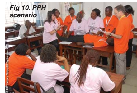
Fig 10. PPH scenario

The delegates were then divided into six multidisciplinary groups according to the number on their ID badge with each group having both a midwife and an anaesthetic facilitator (fig 10) to supervise the role play of two obstetric scenarios – one an APH and the other a PPH.