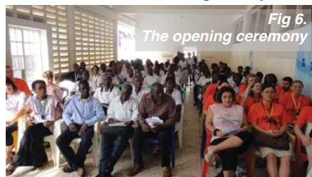
Fig 6. The opening ceremony

different coloured stars (orange, yellow, green or pink) designating the different groups for workshops and also a number between one and six for the multidisciplinary breakout sessions on the morning of day 2.