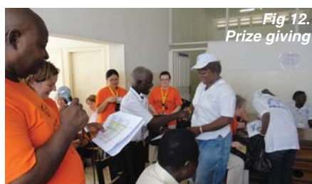
Fig 12. Prize giving