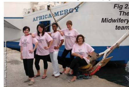
Fig 2. The Midwifery team