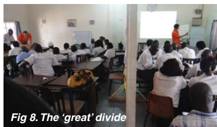
Fig 8. The 'great' divide