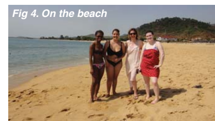
Fig 4. On the beach