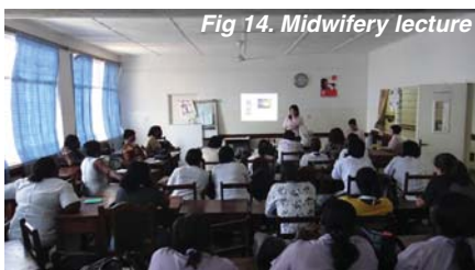
Fig 14. Midwifery lecture

The Midwifery Conference (fig 14) was based on a series of interactive workshops to gain practical experience in areas such as neonatal resuscitation (fig 15) and perineal