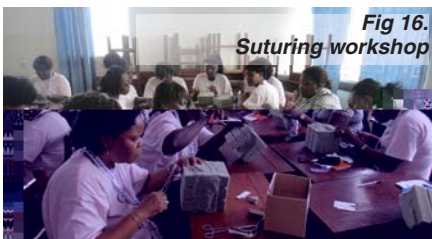
Fig 16. Suturing workshop

working skills and promote communication.