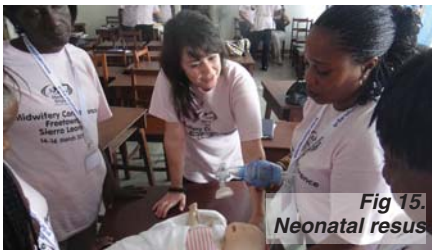
Fig 15. Neonatal resus

The Midwifery Conference (fig 14) was based on a series of interactive workshops to gain practical experience in areas such as neonatal resuscitation (fig 15) and perineal